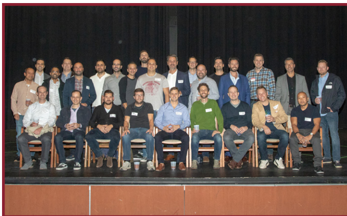
The Class of 1993 - Celebrating 25 years