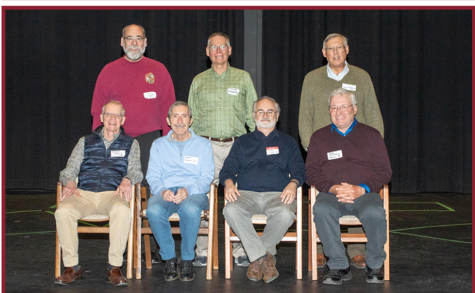
The Class of 1968 - Celebrating 50 years