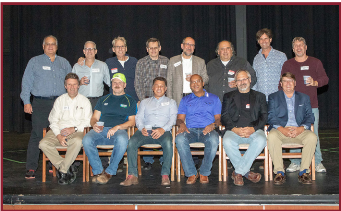
The Class of 1978 - Celebrating 40 years