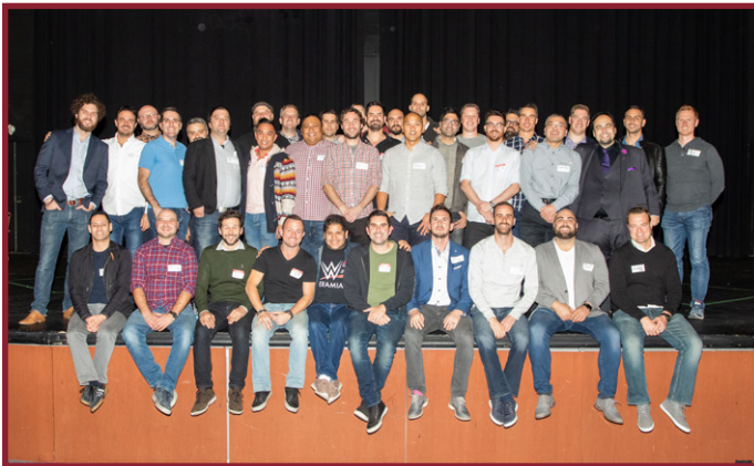
The Class of 1998 - Celebrating 20 years

The opportunity to renew friendships, enjoy a feeling of community and to celebrate the amazing connection with so many great guys is something to cherish..... 'Till next year!!