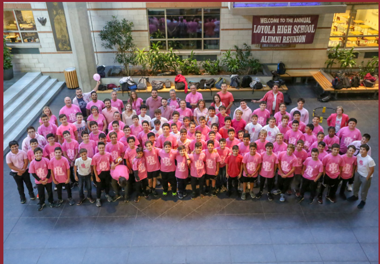
The students and staff helped raise over $5300 towards breast cancer research as part of the “Think Pink” October campaign.