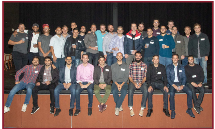
The Class of 2003 - Celebrating 15 years