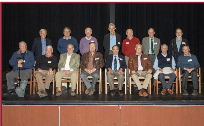
The Class of 1958 - Celebrating 60 years