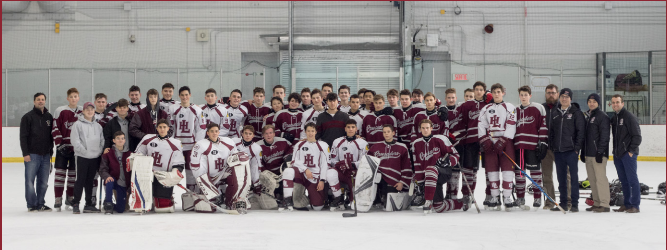
In November, the Juvenile hockey team played host to fellow Jesuit school, St. Paul Crusaders, from Winnipeg.