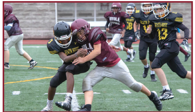
The Secondary 1 Pee Wee football team in action during their jamboree at Molson Stadium.