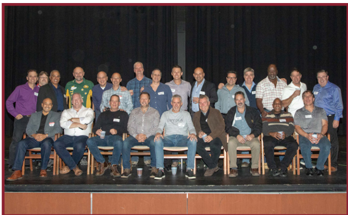
The Class of 1983 - Celebrating 35 years