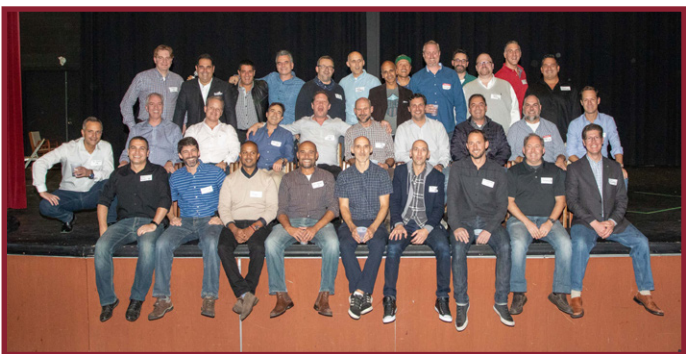
The Class of 1988 - Celebrating 30 years