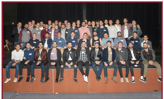
The Class of 2008 - Celebrating 10 years